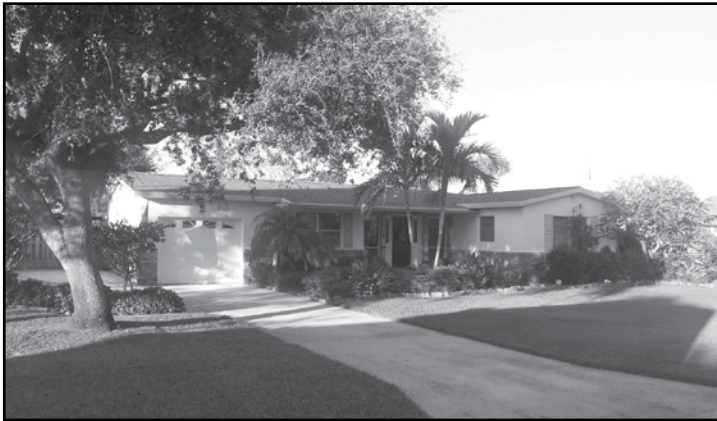
~ AREA 2 ~ Patricia Dooley 145 Sea Park Blvd.