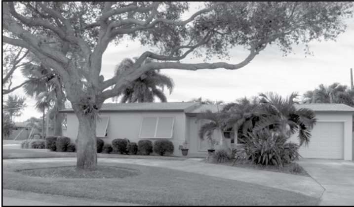
~ AREA 4 ~ Marvin & Sharon Carroll 323 Coral Reef Drive