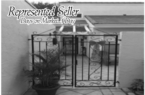
"My home was on the market for 24 hours before we had a full-price-offer. They are excellent and helped me every step of the way."