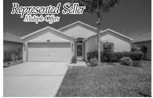
"Outstanding realtors. They sold my house in a couple weeks and literally had people outbidding each other to purchase it. They were always in touch with me and kept me